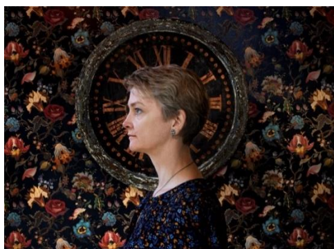
The Rt Hon Yvette Cooper MP by Hannah Starkey (WOA 7636), from the 209 Women exhibition

Photographs from the 209 Women exhibition (WOA 7667) – the Committee purchased a printed archival quality set of all the portraits exhibited in the 209 Women exhibition, where nearly all of the female MPs then sitting in Parliament were photographed to commemorate the 100 th anniversary of women gaining the vote. A digital-copy set was also purchased, as well as five individual full-size works selected by the Committee (the full list of works are listed in Annex B ). These acquisitions would ensure a record of the project for future generations with the printed set stored in the Parliamentary Archives and digital copies for online presentation and engagement.